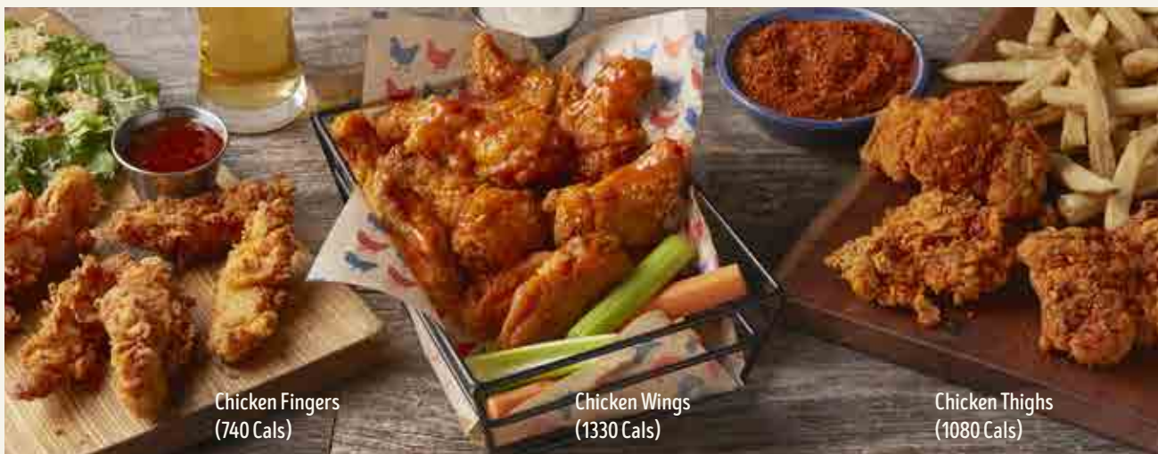
Chicken Fingers (740 Cals)