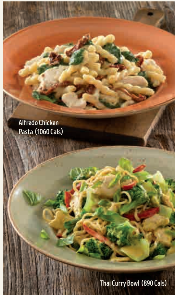
Alfredo Chicken Pasta (1060 Cals)

Made fresh in-house creamy blend of roasted red peppers and tomatoes topped with mini grilled cheese croutons. 7.99 (650 Cals)