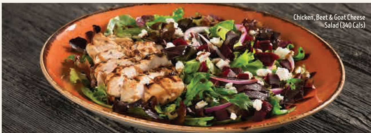
Chicken, Beet & Goat Cheese Salad (340 Cals)

Freshly grilled chicken breast on California greens topped with red peppers, fresh tomatoes, crumbled feta cheese, raisins, croutons, mixed seeds and nuts and finished with our honey citrus dressing. 17.99 (760 Cals)