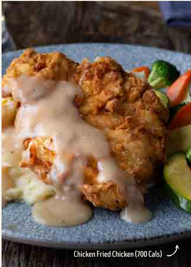
Chicken Fried Chicken (700 Cals) ↗