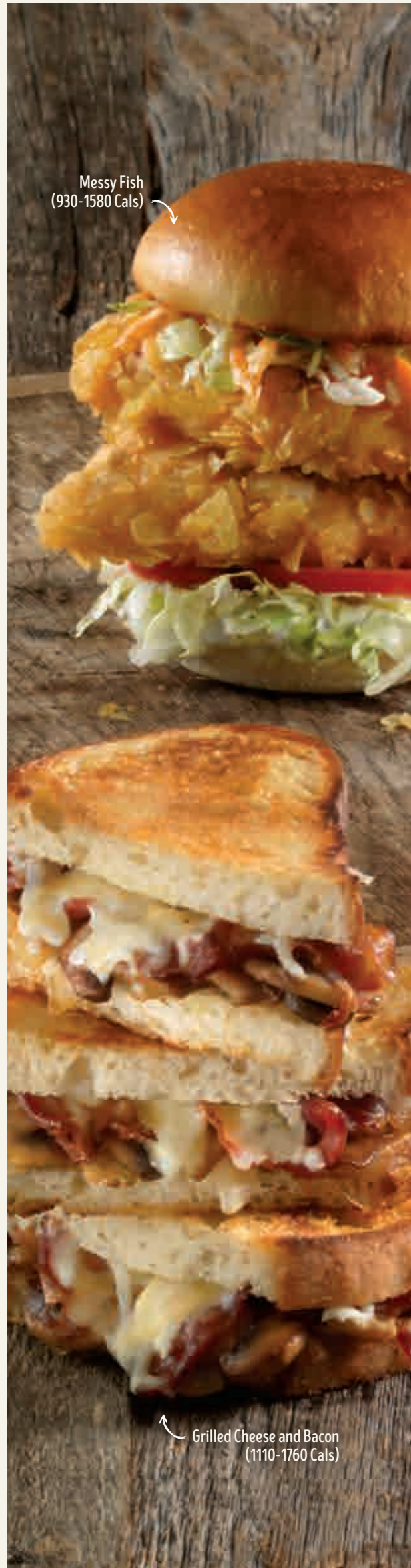
Messy Fish (930-1580 Cals)

Food Allergy Caution - the safety and satisfaction of our Guests is our highest priority. Although precaution is taken to manage the risk of allergen cross contamination in our kitchen, please be advised that there is a possibility of cross contamination during preparation. Therefore, we cannot guarantee that a menu item is free of peanuts, tree nuts and/or other allergens. Applicable taxes extra. Gluten Friendly items are made with gluten free ingredients, however, please be advised that cross contamination with gluten containing products may occur in our kitchen during preparation. Please ask your server for details.