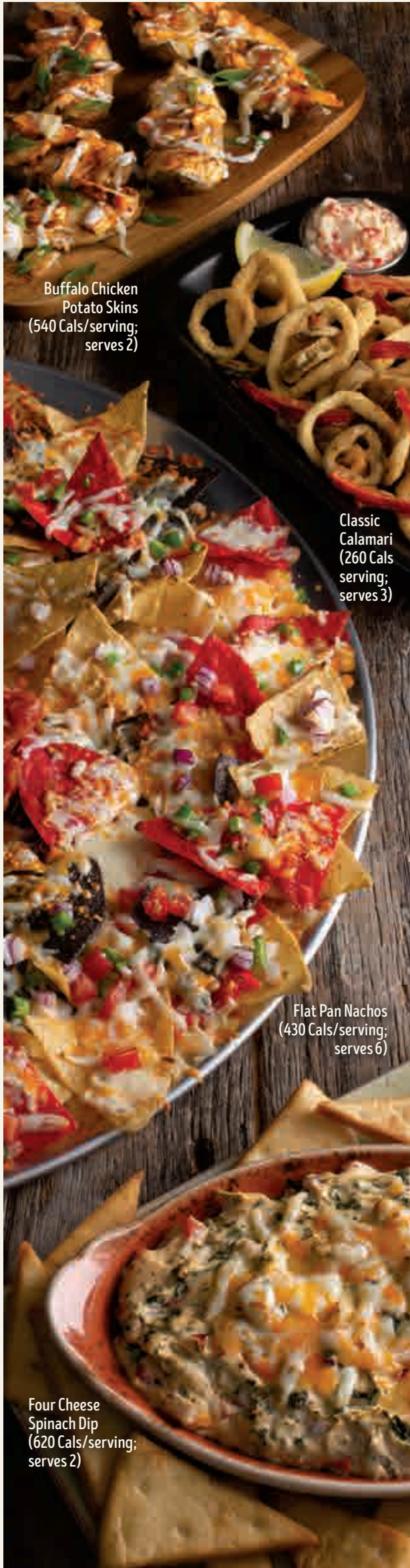
Buffalo Chicken Potato Skins (540 Cals/serving; serves 2)