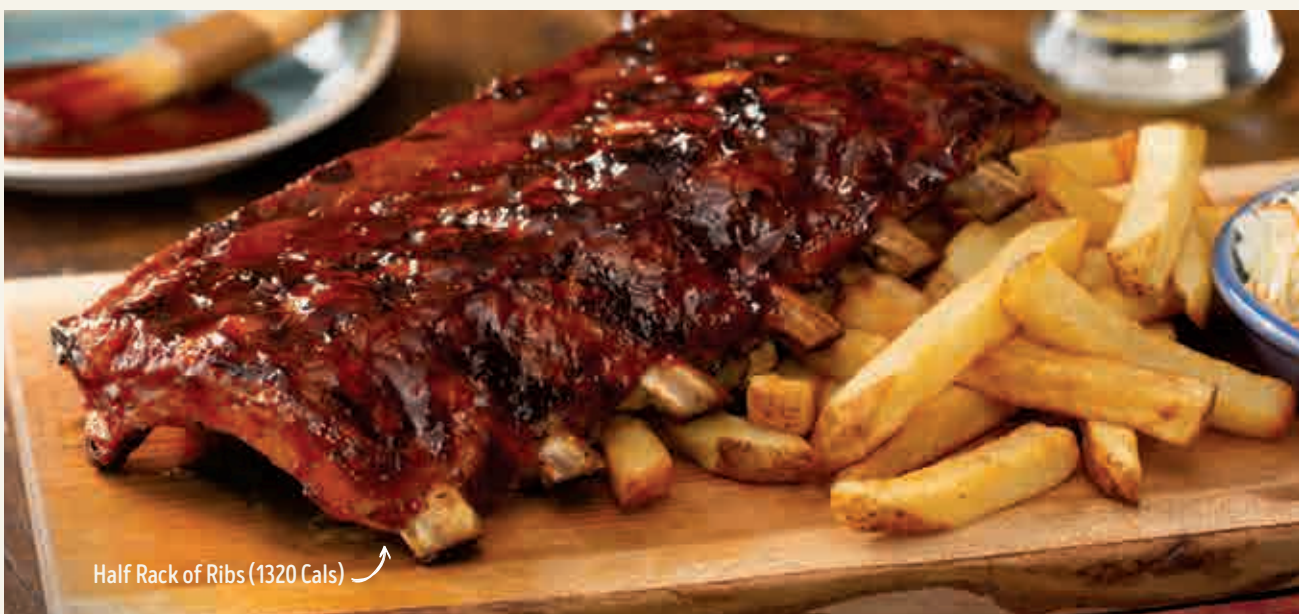
Half Rack of Ribs (1320 Cals)

Atlantic salmon oven baked with a lemon pepper seasoning and served with basil pesto aioli, basmati rice and freshly steamed veggies. 24.99 (870 Cals)